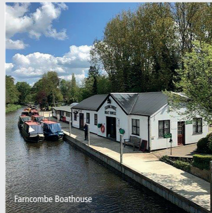
Farncombe Boat House