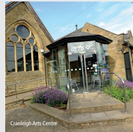
Cranleigh Arts Centre